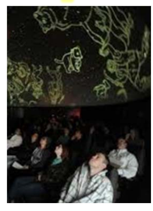
World class planetarium