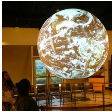
Science on a Sphere