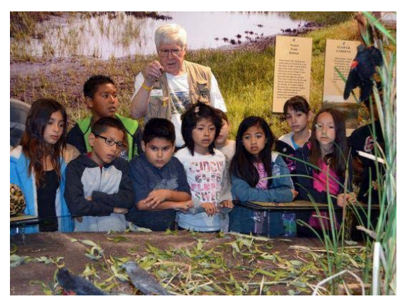
Natural history and live animal school tours