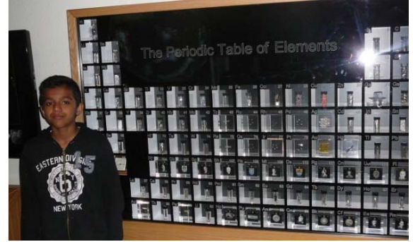
Interactive Periodic Table

The Great Valley Museum is a nonprofit 501(c)(3). For more information, please visit us online at <a href="https://www.mjc.edu/gvm">www.mjc.edu/gvm</a>.